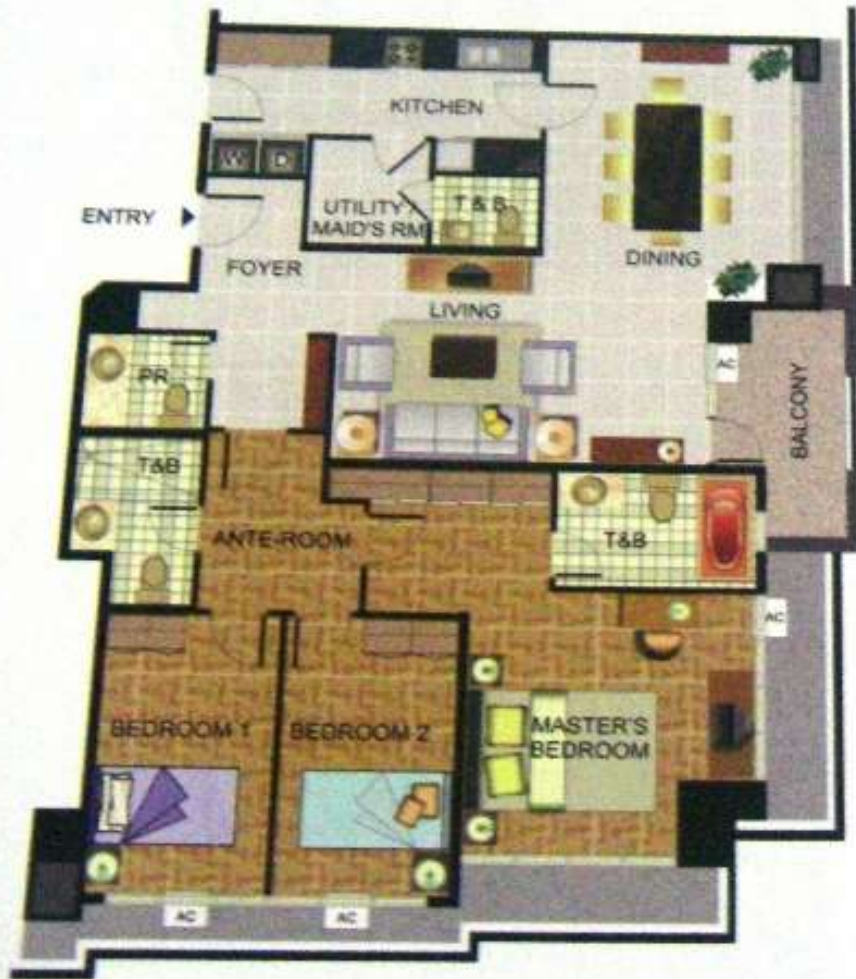
Typical 3 Bedroom Penthouse Unit Approx. 139.00 sqm with Balcony